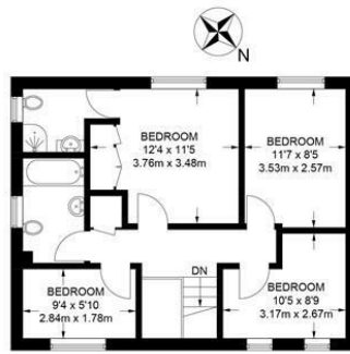
FIRST FLOOR 552 SQ FT / 51.3 SQ M